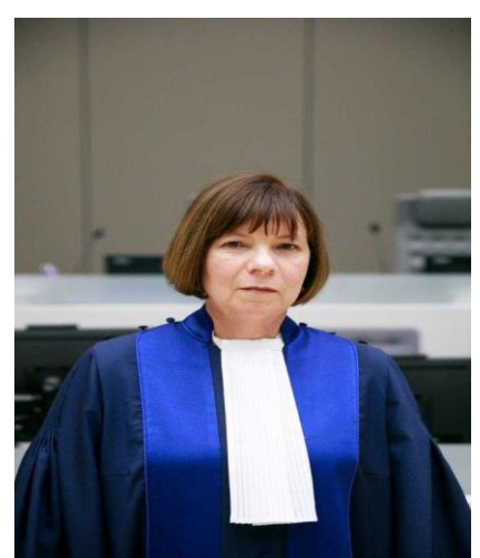
Judge Kimberly Prost*