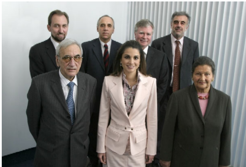
Front: The Members of the Board of Directors: His Excellency Mr.Tadeusz Mazowiecki; H.R.H. Queen Rania Al-Abdullah; and Madam Minister Simone Veil. Back: H.R.H. Prince Zeid Al-Hussein, President of the Assembly of States Parties; Bruno Cathala, Registrar of the ICC; Philippe Kirsch, President of the ICC; and Luis Moreno-Ocampo, Prosecutor of the ICC.

Please note that photographs are available free of copyrights at the ICC. Request should be sent to pio@icc-cpi.int