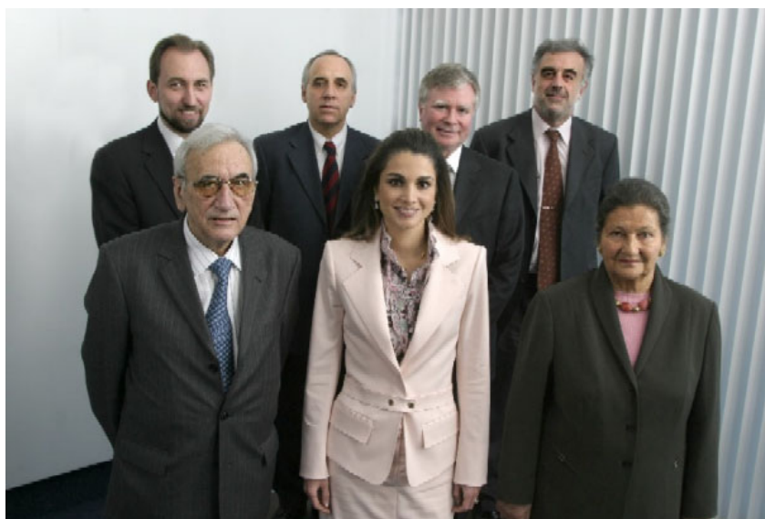
Front: The Members of the Board of Directors: His Excellency Mr. Tadeusz Mazowiecki; H.R.H. Queen Rania Al-Abdullah; and Madam Minister Simone Veil. Back: H.R.H. Prince Zeid Al-Hussein, President of the Assembly of States Parties; Bruno Cathala, Registrar of the ICC; Philippe Kirsch, President of the ICC; and Luis Moreno-Ocampo, Prosecutor of the ICC.

Please note that photographs are available free of copyrights at the ICC. Request should be sent to pio@icc-cpi.int