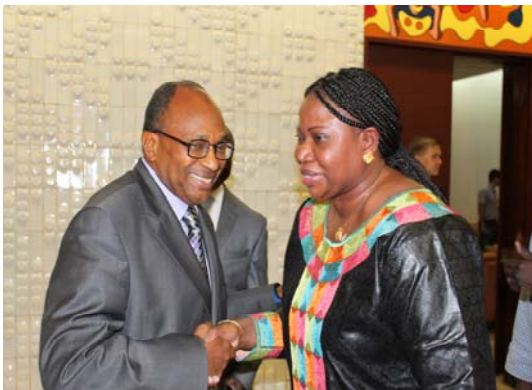
Deputy Prosecutor Fatou Bensouda with Guinea Justice Minister, Christian Sow

In Côte d'Ivoire, the OTP discussed general cooperation aspects in support of its ongoing investigation in the situation. Deputy Prosecutor Bensouda reiterated the OTP's thanks to the Ivorian Government, to representatives of all parties, as well as to civil society for their support for the work of the Court. The OTP will continue its investigation: it intends to bring the most responsible of the gravest crimes, whatever their political affiliation, before the judges, while taking into account the national judicial system investigating other crimes.