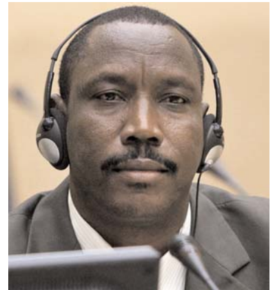
Abu Garda at the hearing

On 18 May this year Abu Garda, a member of the Zaghawa tribe of Sudan, appeared for the first time before the Court, in compliance with a summons issued under seal by Pre-Trial Chamber I on 7 May and unsealed on 17 May.