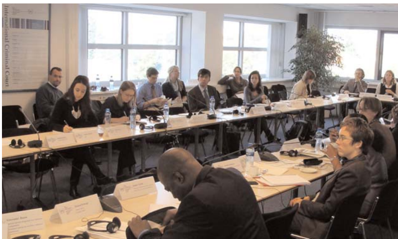
International and local NGOs attended the Biannual Strategic Meeting with ICC

Opening the meeting, ICC President, Judge Sang-Hyun Song, acknowledged the “long partnership of the Court with the NGO community in working to realise the Rome Statute system”. “Importantly, NGOs also provide constructive criticism. It is never entirely pleasant to be criticised, and the Court may not always agree with such criticism. But I very much appreciate independent views from organisations and individuals who share the Court’s deep commitment to the goals and values enshrined in the Rome Statute. Your support – and your tough love too – have made this a better institution” President Song added.