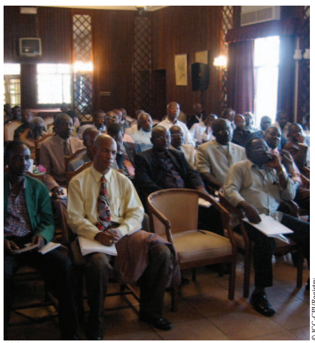
ICC Seminar Kisangani

On Thursday 2 April, members of the delegation from the ICC Registry attended a one-day seminar organised by the Ministry of Foreign Affairs entitled "Mieux connaître la CPI, pour mieux coopérer" (facilitating cooperation through a better knowledge of the ICC).