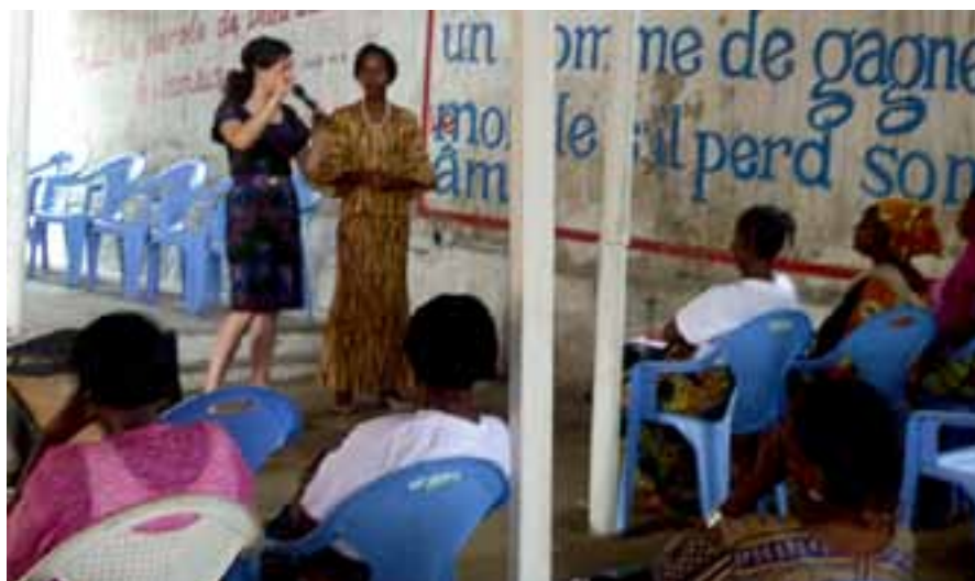
Field Outreach Coordinator answers questions from Congolese women on crimes of sexual violence

On 24 February 2011, Outreach staff conducted a seminar focused on crimes of sexual violence with women's groups in Kinshasa. The first part of the seminar focused on the Congolese law on crimes of sexual violence, adopted in 2006, and its application in the DRC. The second part explored relevant aspects of the legal texts of the Court, including an explanation of the elements of the crimes of rape, sexual slavery, enforced prostitution, forced pregnancy, and enforced sterilization. During the third part of the seminar, participants were updated on the latest developments at the Court in the cases containing charges for crimes of sexual violence. As the session was limited to women only, it allowed for an environment in which the participants felt comfortable enough to ask sensitive questions and share their stories.