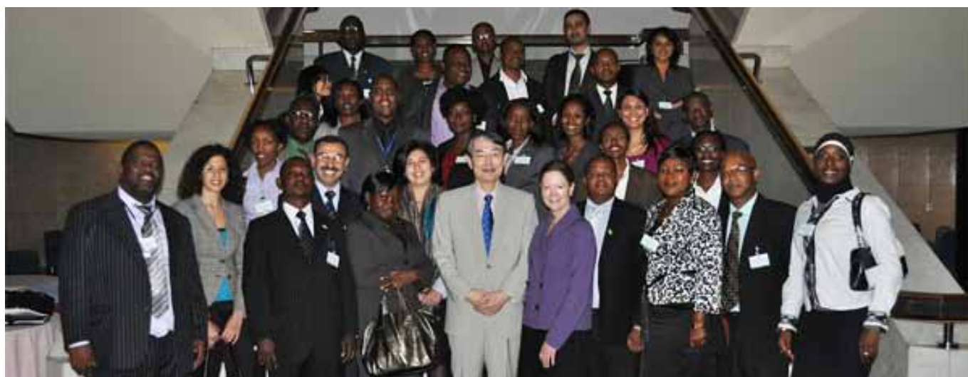
ICC President Sang-Hyun Song with a group attending his lecture in Addis Ababa, Ethiopia

The President of the International Criminal Court (ICC), Judge Sang-Hyun Song, paid a three-day visit last week to Addis Ababa, Ethiopia. On Monday, 14 February 2011, President Song held a full-day lecture on international criminal law for government officials and other young or mid-career lawyers from 24 African States, as well as observers from the African Union Commission. The lecture was part of a