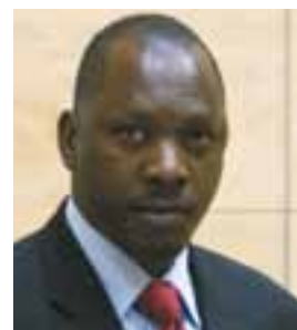
Thomas Lubanga Dyilo

Thomas Lubanga Dyilo is accused of having committed, as co-perpetrator, war crimes of enlisting and conscripting children under the age of 15 years into the Forces patriotiques pour la libération du Congo (Patriotic Forces for the Liberation of Congo) (FPLC), and using them to participate actively in hostilities in Ituri, a district of the eastern province of the Democratic Republic of the Congo (DRC), between September 2002 and August 2003.