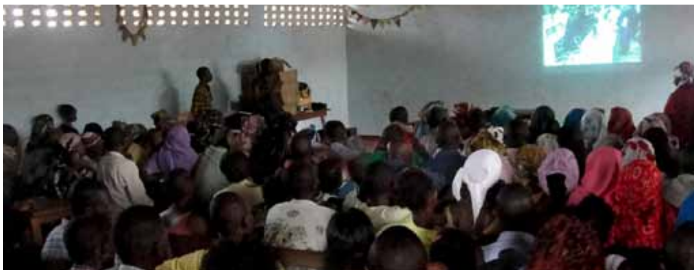
The population of PK12/PK13 takes part in the outreach activities organised by the ICC

On Tuesday 22 February, the Outreach Unit of the Field Office of the International Criminal Court (ICC) in the Central African Republic travelled to Point Kilométrique 13 (PK13) on the outskirts of Bangui to inform and talk with the affected local community about the trial in the case of The Prosecutor v. Jean-Pierre Bemba Gombo .