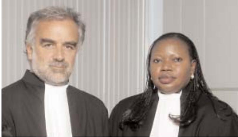
Procekyuta, Luis Moreno-Ocampo ki Lalub Kor Procekyuta, Fatou Bensouda.