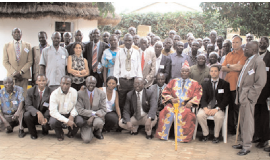
Photo: ICC staff with Langi cultural leaders in Lira during an informative workshop.

From 15 to 30 June 2006, the International Criminal Court held a series of workshops in Lira, Soroti, Gulu and Kampala with Ateso and Langi traditional leaders, local council members, the Ugandan Human Rights Commission (UHRC) and the United Nations Office of the High Commissioner for Human Rights (UNHCHR).