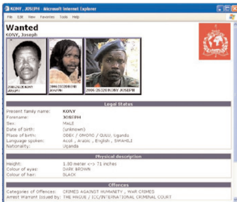
Interpol Red Notice for Joseph Kony