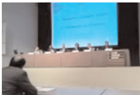
Fourth Seminar on Counsel Issues

As in previous seminars, the fourth seminar brought together judges, experts and representatives of lawyers' associations, non-governmental organizations, ad hoc Tribunals and Special Courts as well as staff from the different organs of the Court. For the first time, the seminar was attended by one hundred of the counsel included on the list maintained by the Registrar. They participated actively and provided valuable input.