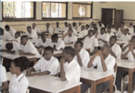
Seminar on the ICC at Boboto College

For school authorities, the information campaign is "part of the fight against impunity. It is civic action".