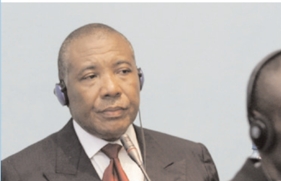
Charles Taylor before a Trial Chamber of the SCSL

The trial will be conducted by a Trial Chamber of the Special Court sitting in The Hague. The ICC will not conduct the trial of Mr Taylor. Under the terms of the MOU, the ICC will provide courtroom services and facilities, detention services and facilities and related assistance. All costs will be paid in advance by the Special Court, through a Trust Fund established by the ICC Registrar.