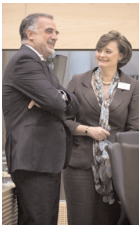
Prosecutor Luis Moreno Ocampo and Cherie Booth QC, at the OTP hosted expert meeting on gender crimes

women were allegedly being committed on a large scale in Darfur, mainly during attacks on villages, or as people were forced to