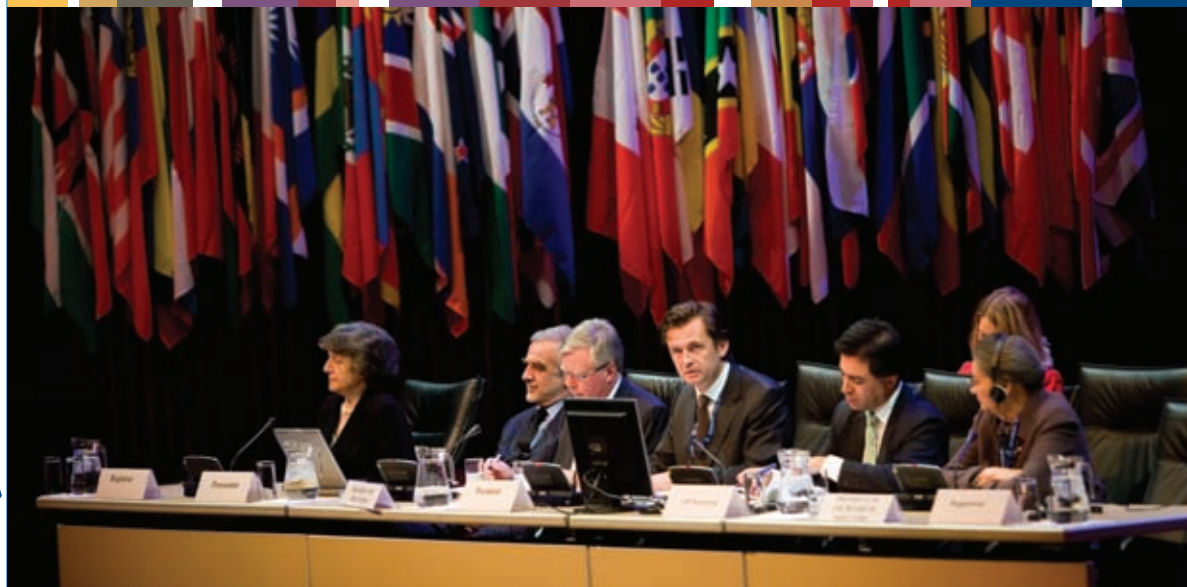
Seventh session of the Assembly