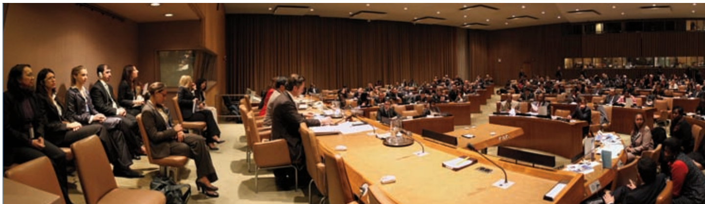
First resumption of the seventh session, 19 to 23 January 2009, United Nations Headquarters