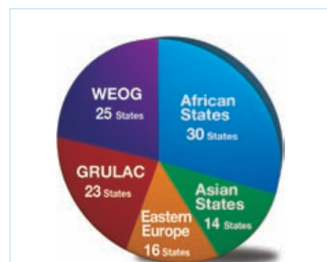
The 108 States Parties to the Rome Statute belong to the following regional groups.