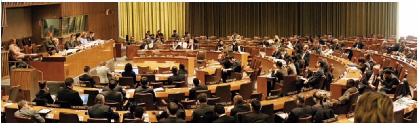
Second resumption of the seventh session, 9 to 13 February 2009, United Nations Headquarters

On 7 April 2009 the Senate of Chile approved Draft Bill 6406-07 that aims at incorporating crimes against humanity, the crime of genocide and war crimes into national legislation. This bill still requires the approval of the Chamber of Deputies to become law. In this connection, on 15 April the Chamber’s Human Rights Committee approved the bill, which must then be considered by the Chamber’s Constitutional Committee, foreseen in early May, prior to its submission to the plenary of the Chamber of Deputies. Once that occurs, Chile would proceed with the pending constitutional amendment required by the Constitutional Court in its decision of April 2002 concerning the Rome Statute and thus be ready to deposit its instrument of ratification.