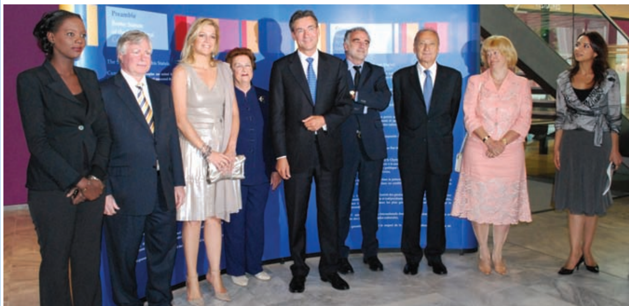
Tenth anniversary of the adoption of the Rome Statute in The Hague

On 3 July 2008, a celebratory event was held at the Peace Palace in The Hague, organized jointly by the Ministry of Foreign Affairs of the Netherlands, the Embassy of France and the Coalition for the International Criminal Court. Keynote statements were delivered by, inter alia, Mr. Maxime Verhagen, Minister of Foreign Affairs of the Netherlands, and Ms. Rama Yade, Secretary of State for Foreign Affairs and Human Rights of France.