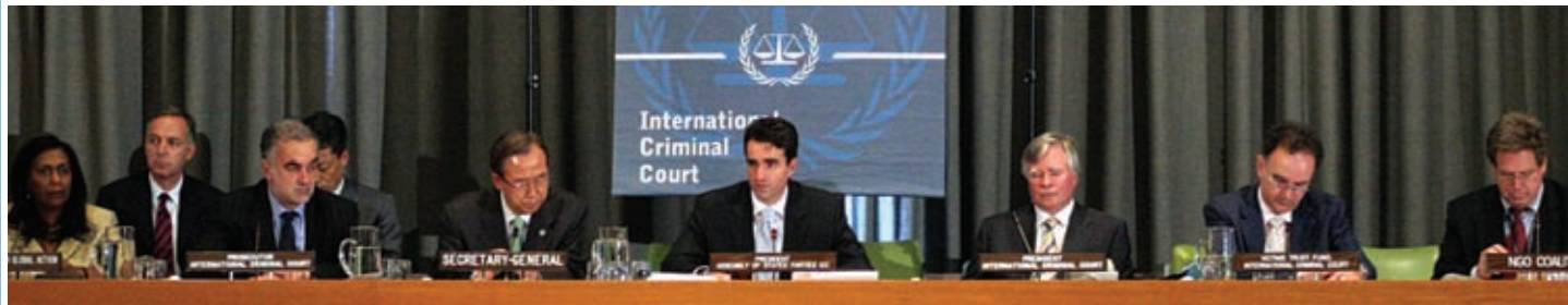
Tenth anniversary of the adoption of the Rome Statute in New York