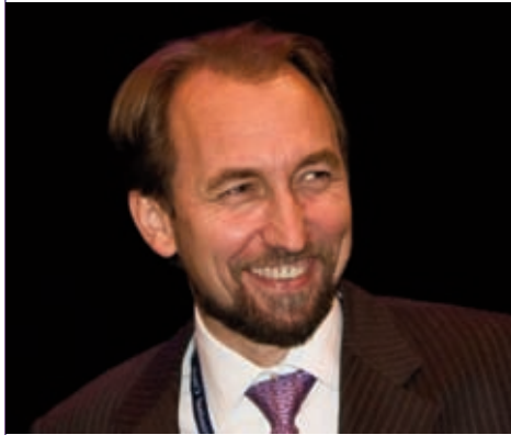
President of the Assembly of States Parties (2002-2005) and Head of the delegation of Jordan

Given that you are one of progenitors of the Statute, as well as having been the first President of the Assembly for the period 2002-2005, can you share with us your impressions of how the Court has evolved?