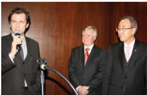
From left: Mr. Christian Wenaweser, President of the Assembly, judge Philippe Kirsch, President of the Court and H.E. Mr. Ban Ki-moon, Secretary-General of the United Nations, at the reception organized by the Permanent Mission of Finland and the CICC.

On 10 February and 9 March 2009, receptions were held in New York and The Hague, respectively, in honour of President Philippe Kirsch, who was ending his six year term as judge and his second three year term as President of the Court on 10 March. Prior to his election as a judge, Mr. Kirsch had chaired the Working Group of the Whole at the 1998 Rome Diplomatic Conference, as well as the Preparatory Commission for the establishment of the International Criminal Court from 1999-2002.